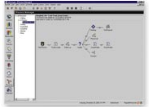
Design custom campaign processes to quickly turn prospects into customers.

Manage all the components of your campaign. Assign and schedule tasks for deliverables — then see every detail of your campaign at a glance. You can even associate forecasted vs. actual budget for each task and SalesLogix automatically rolls it up into the overall campaign.