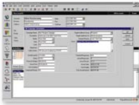
Create and track all components of your marketing campaign easily and in one place.

Analyze your prospect list with easy-to-use data mining tools. Using the MarketMiner™ Response Wizard, you can select the criteria of your ideal target prospect. MarketMiner mines your lists and rates each prospect — so you can find the most responsive audience for your campaign and increase your revenues.